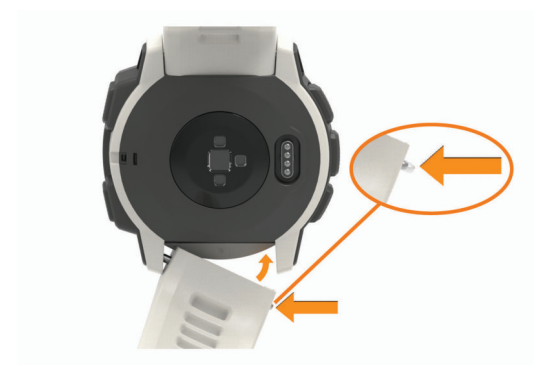
NOTE: Make sure the band is secure. The watch pin should align with the holes on the device.